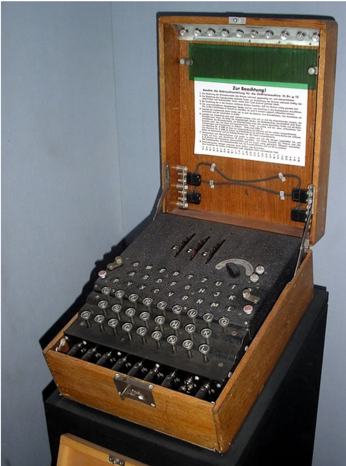
Image Source Credits: This work has been released into the public domain by its author, Karsten Sperling ( http://spiff.de/photo ). This applies worldwide.

The Enigma machines are a series of electro-mechanical rotor cipher machines mainly developed and used in the early- to mid-20th century to protect commercial, diplomatic and military communication. Enigma was invented by the German engineer Arthur Scherbius at the end of World War I.